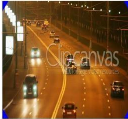
Fig -2 Reference video frame.