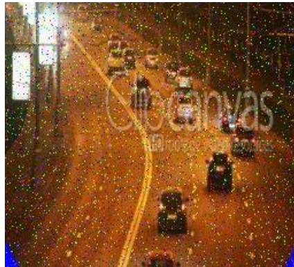
Fig -3 Test video frame.

Here the obtained spatial quality score 0.6256 lies between 0 and 1 for which the tested video is treated as a high quality video sequence